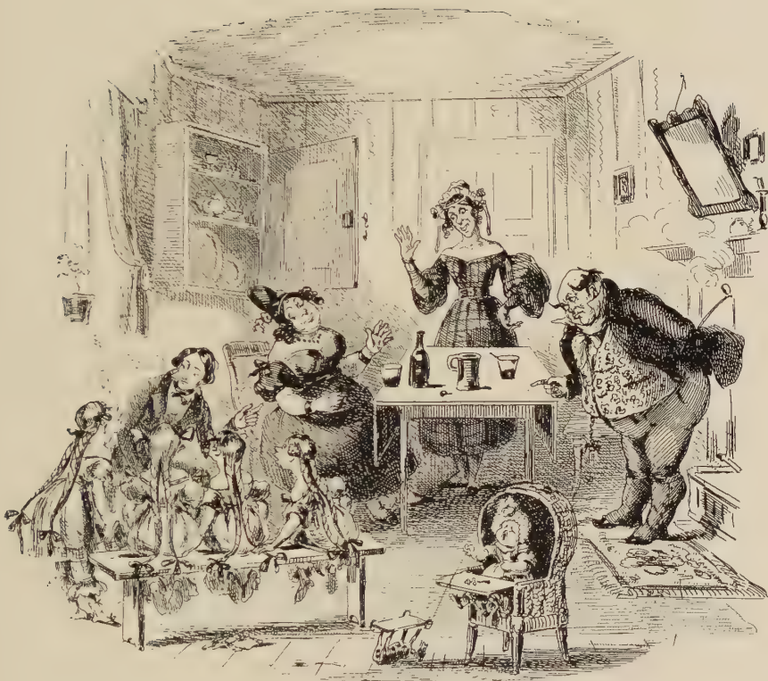
NICHOLAS ENGAGED AS TUTOR IN A PRIVATE FAMILY.